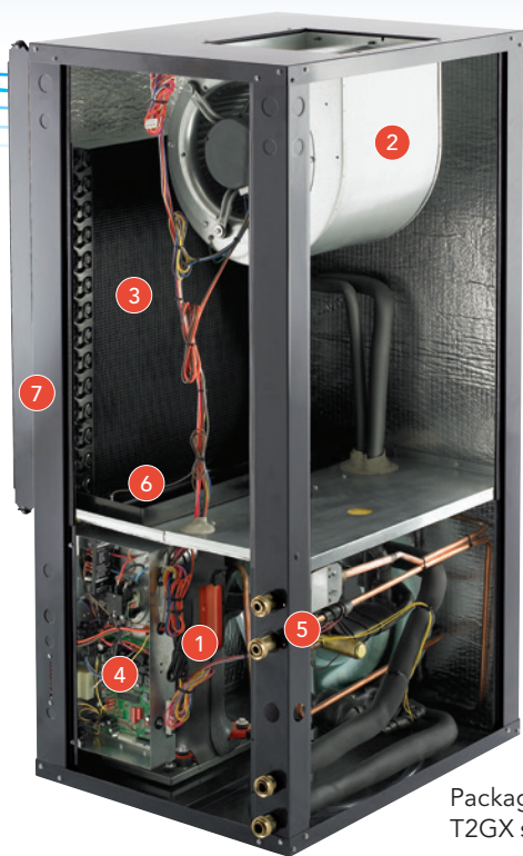
Packaged System T2GX shown.