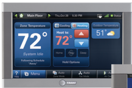
ComfortLink™ II XL950 Control

Innovative Trane controls and thermostats enhance the comfort of your Trane EnviroWise™ Geothermal System.