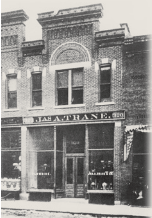
Trane Storefront La Crosse, Wisconsin 1891